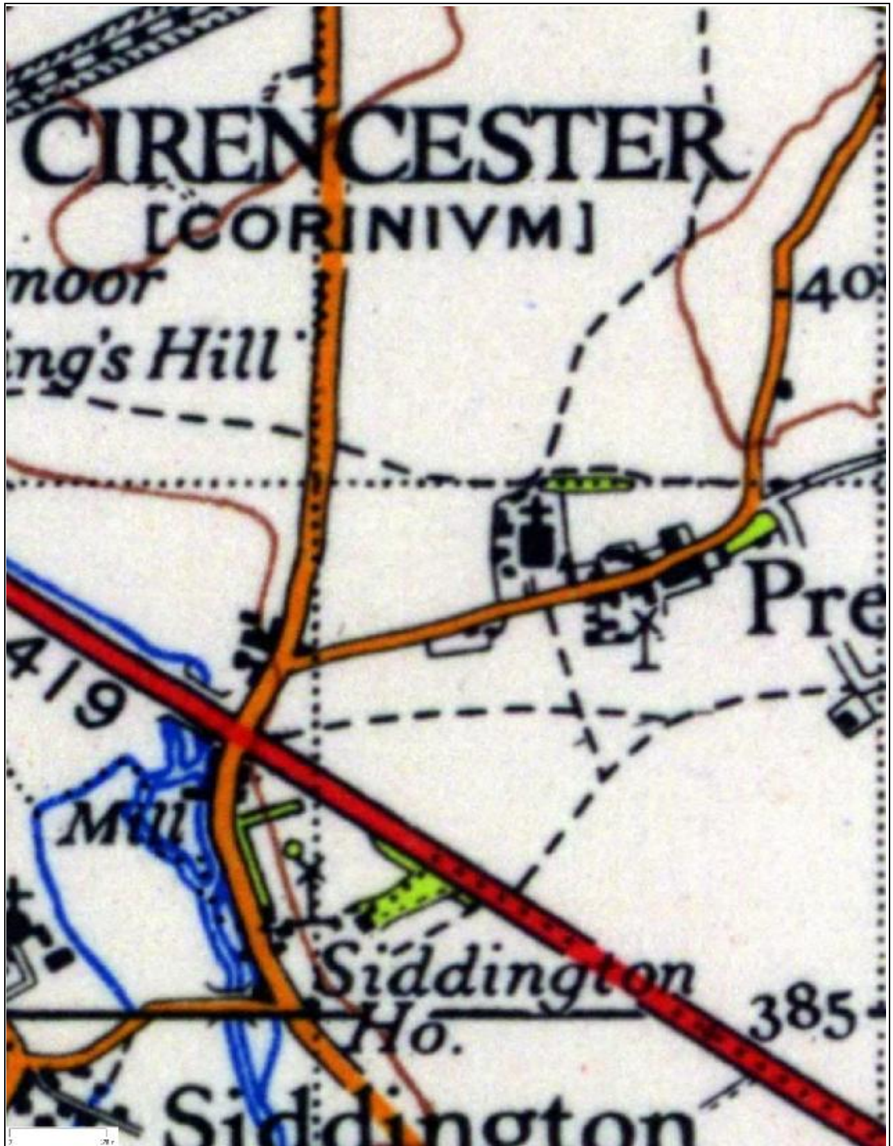
Date Created: 31-5-2016 | Map Centre (Easting/Northing): 404204 / 200837 | Scale: 1:8210 |