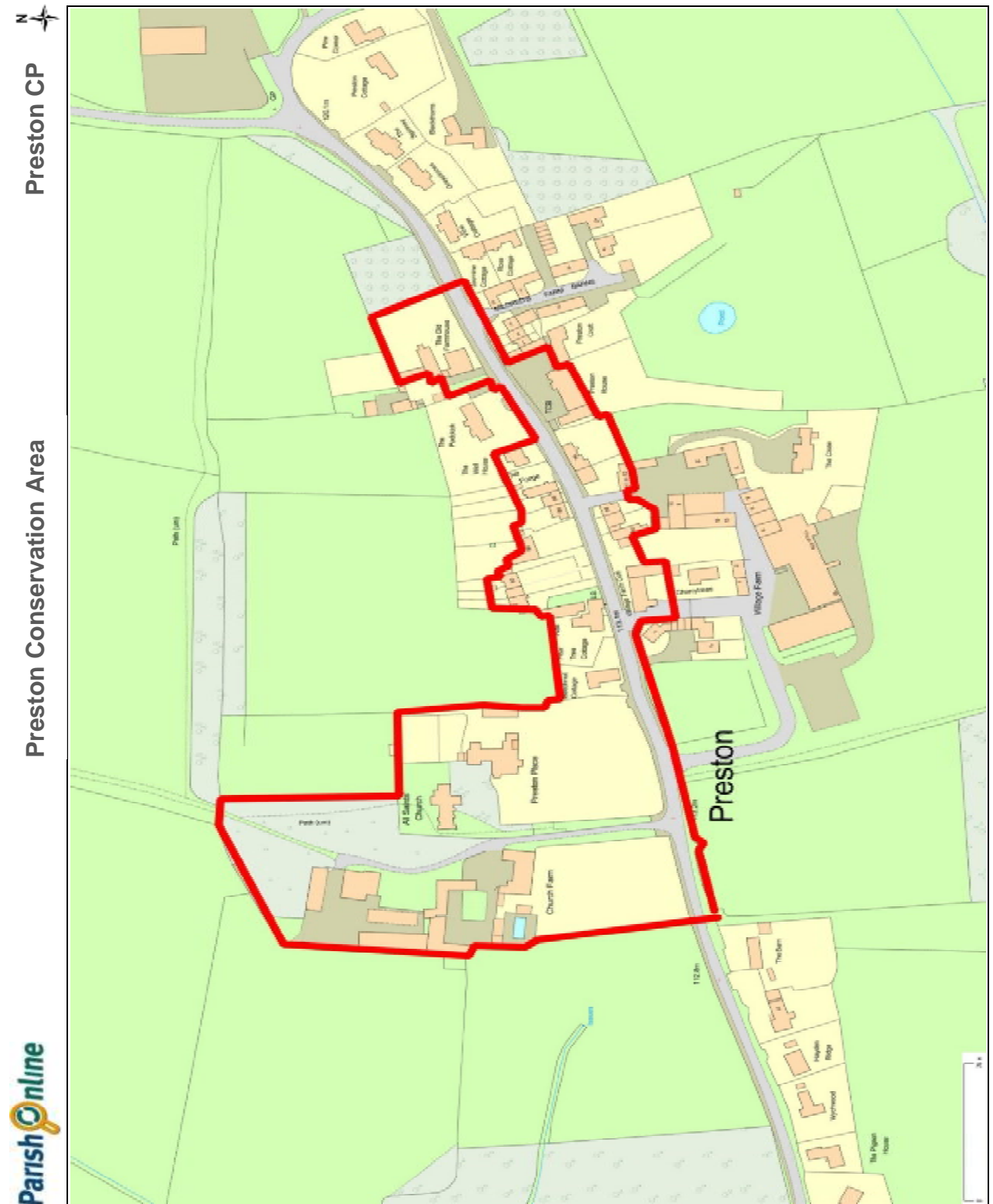
Date Created: 1-6-2016 | Map Centre (Easting/Northing): 404506 / 200855 | Scale: 1:2407