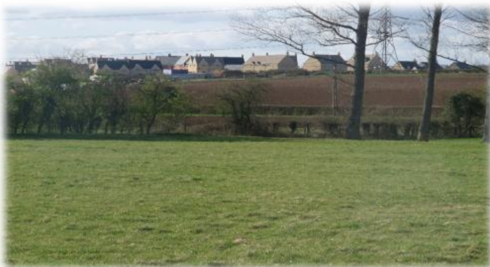
Rural Buffer between Preston Village and Cirencester

Further, in response to the statement that “ the Parish consists predominantly of farm land, with domestic accommodation and a small industrial provision ”, 94% of the respondents considered the current land use is well-balanced.